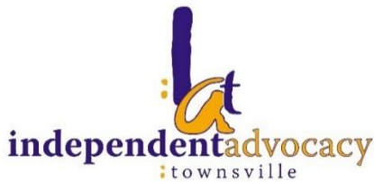
Independent Advocacy Townsville