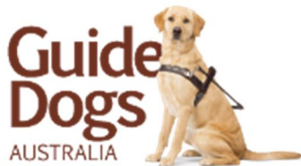
Guide Dogs Australia