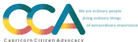
Capricorn Citizen Advocacy